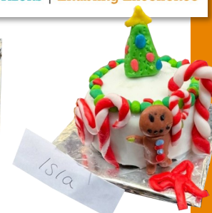
Festive Baking, Year 9 and 10 Christmas Cakes